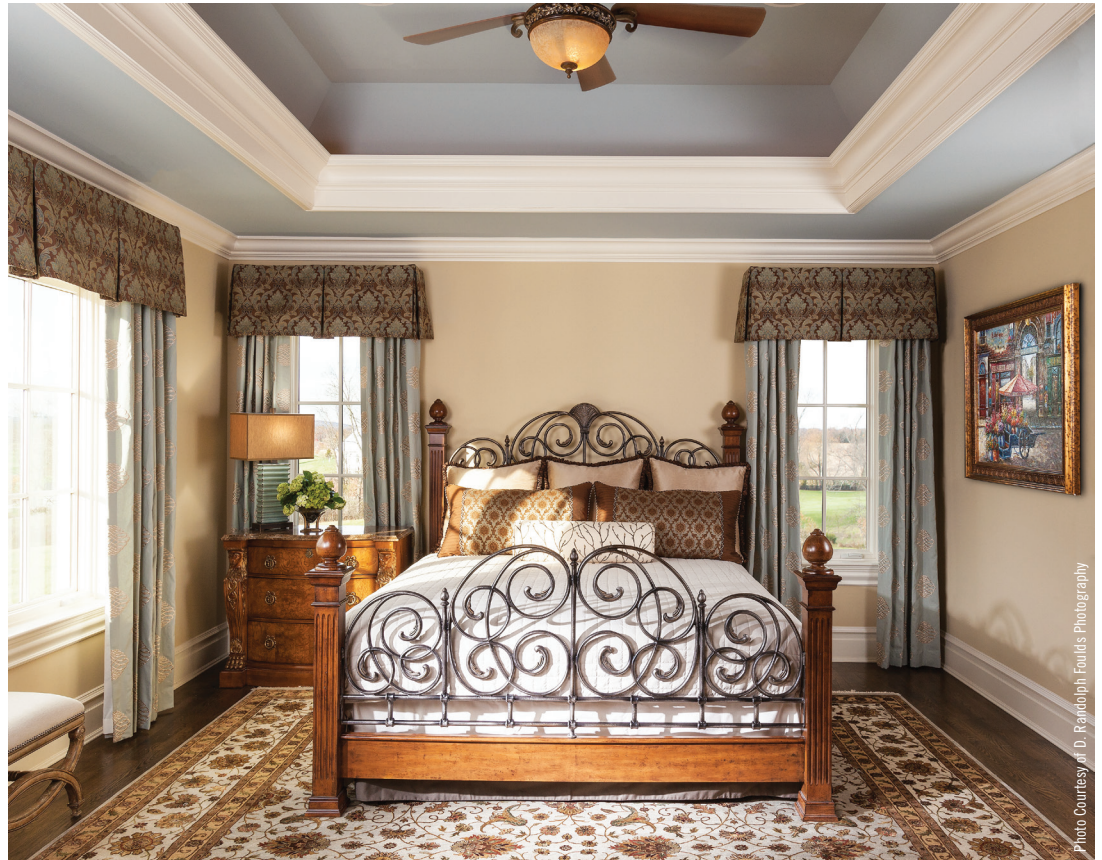
A neutral palette using creams, tans and grays gives a softer touch, according to Lauren Nicole Designs.

Space for clothing/luggage – Free up some drawer and closet space, or have an empty dresser or bureau. That way guests can unpack instead of digging through his or her suitcase. Be sure to have hangers free in the closet, too. If there's not enough room for a dresser, or the closet in the room is packed full, luggage