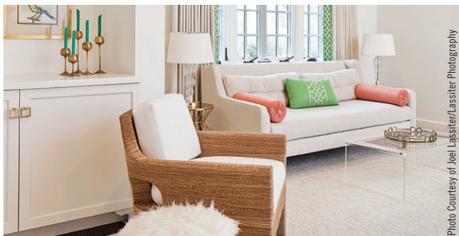
A nice-sized sitting area is always a convenient way for guests to have more space in their room.

The holidays are synonymous with traveling to visit friends and family and that often means hosting overnight company at your home. Creating a space for them to feel warm and welcome is essential and easy. Even if they are staying in one of your kid's rooms or an office with a bed in it, there are easy ways to make them feel relaxed and like it's a space designed just for them.