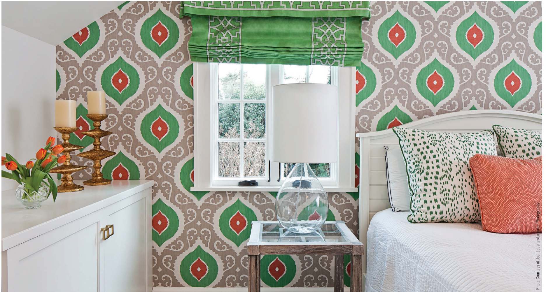
Laura Archibald Interior Design recommends incorporating bold colors in places like wallpaper, curtains and throw pillows.